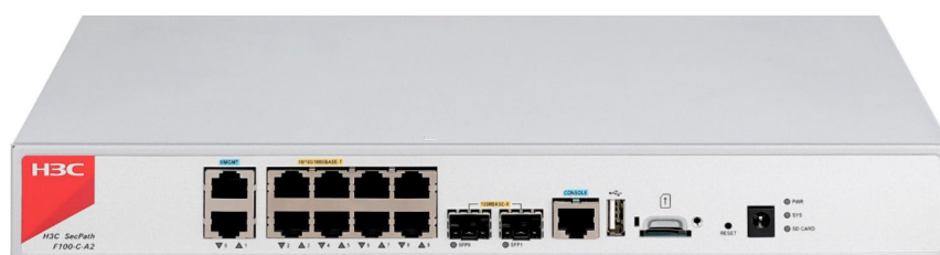
H3C SecPath F100-C-A2 firewall